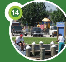
Turner Station Park