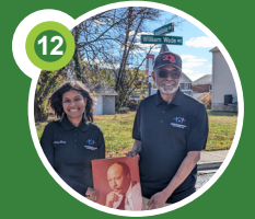
William Wade Ave.