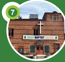
Union Baptist Church