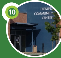
Fleming Senior Center