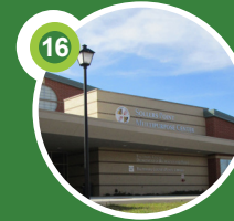
Sollers Point MPC