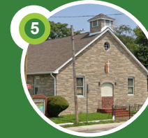
St. Matthews UMC